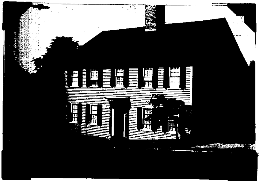
"Welcome Congdon" House