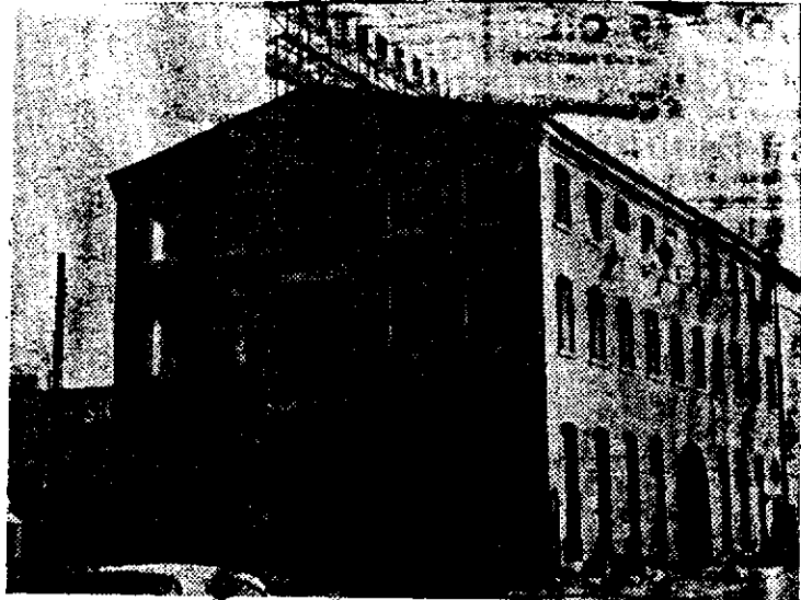
Antiquated foundry, before rebuilding program began in fall.